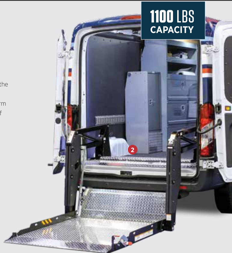
MODEL V2-56-1140 FA49

Pump and motor housing fits compactly over the wheel well. The pump box can also be relocated with our Pump Box Relocation Kit. (optional)