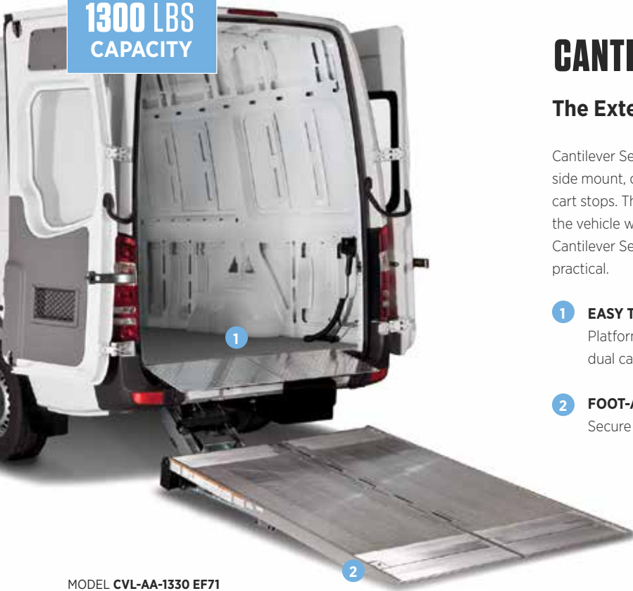
MODEL CVL-AA-1330 EF71